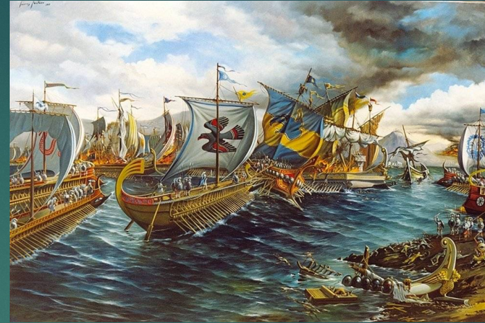
Battle of Salamis. 480 BC