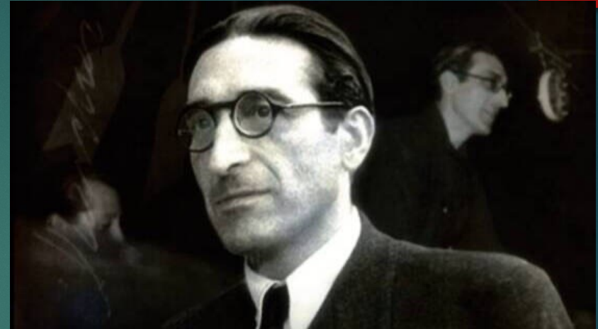
Rafael Sánchez Mazas